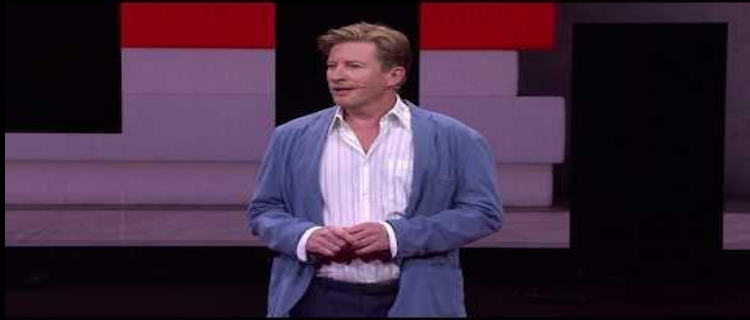
Acting - What is it? How to do it? Why do it? | David Wenham | TEDxSydney