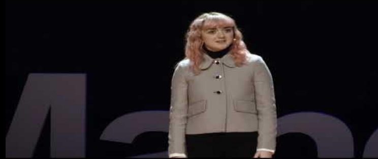
Don't strive to be famous, strive to be talented | Maisie Williams | TEDxManchester