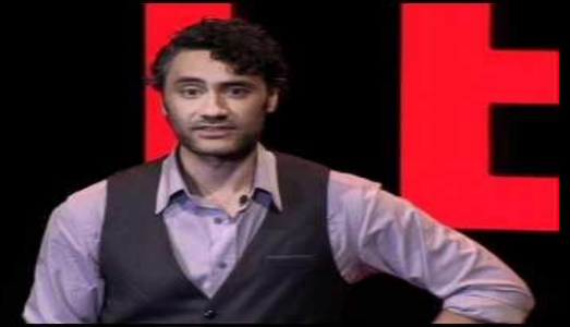
The Art of Creativity | Taika Waititi | TEDxDoha